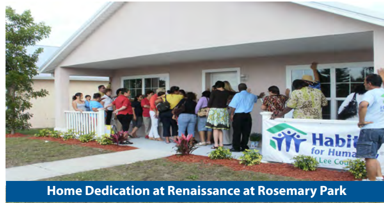
Home Dedication at Renaissance at Rosemary Park