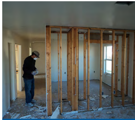
Chinese Drywall is Remediated

George Washington said that, "Friendship is a plant of slow growth and must undergo and withstand the shocks of adversity before it is entitled to the appellation." It is rewarding to know that Habitat's relationship with our friends is strong, as evidenced by the reaction to the discovery last fall of Chinese drywall in some of our homes.