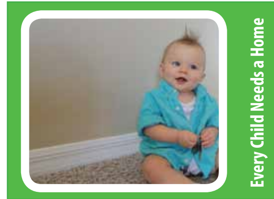
Every Child Needs a Home