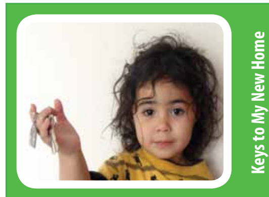
Keys to My New Home