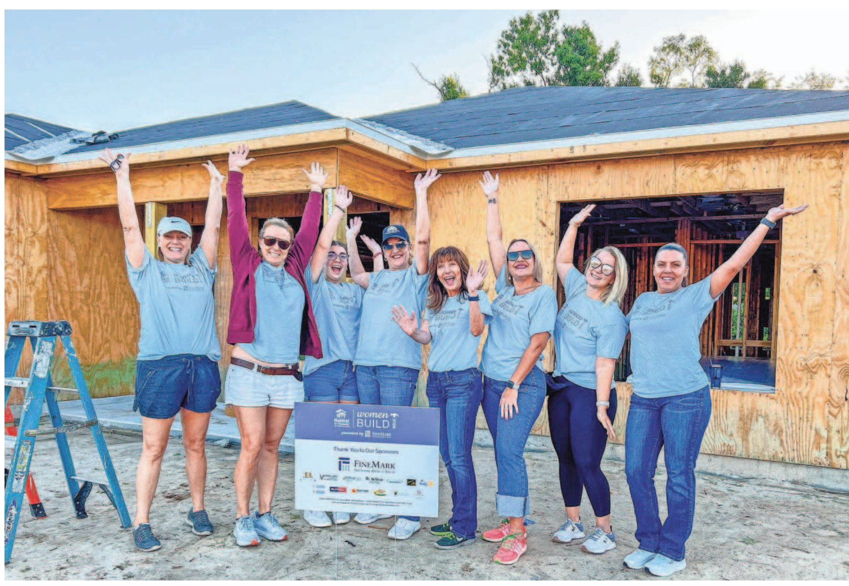
Volunteers celebrate on site.