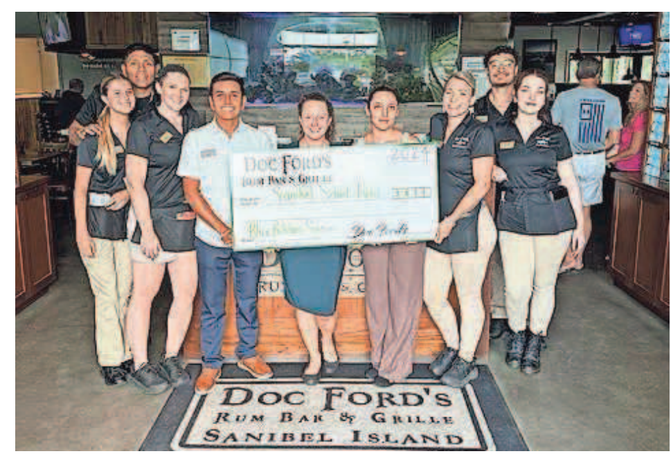
Doc Ford's Rum Bar & Grille donated $3,000 to support The Sanibel School's 2024 Blue Ribbin Classic Golf Tournament and Gala in early May.